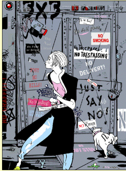
ISSUE FOUR (LIMITED COPIES AVAILABLE)

Istvan Banyai : Cathie Bleck : Raul Col n