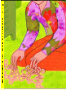
ISSUE TWO (LIMITED COPIES AVAILABLE)