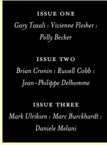
BACK ISSUES STILL AVAILABLE